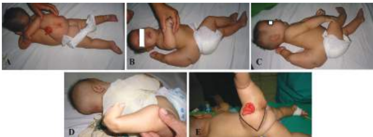
Fig. 1: A-E: The accessory lower limb was arising from the lower back at the level of L2 to S1. It was pointing cranially. Grossly, it resembled a normal lower limb with a partially developed foot containing only big toe and the next adjacent toe. The accessory limb was bearing four blind ending gut loops of red color. These used to wet the clothing with their watery secretion. Additionally, there were areas with pitting and dimples, mimicking the natal cleft and anus.

The CT scan findings of the accessory lower limb were also re-confirmed. The cranial magnetic resonance was normal with no associated cerebral anomalies found. Written