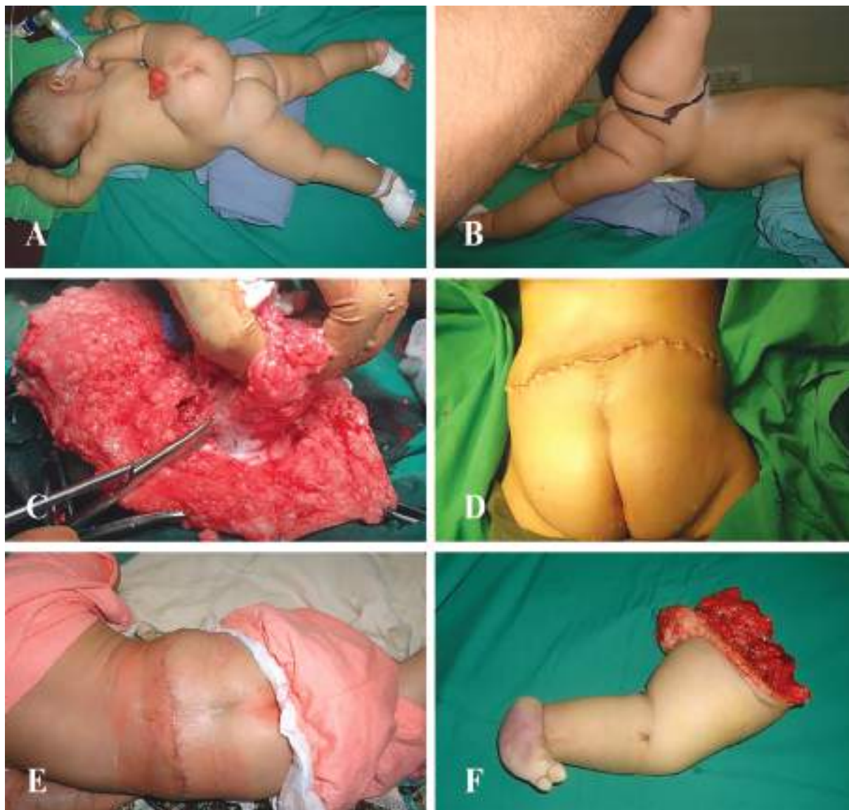
Fig. 3: A: The infant was positioned prone on the operating room table for undertaking surgery. B: An elliptical skin incision with transverse orientation was designed to ensure adequate closure of the resultant defect after limb extirpation. C: The neural placard was carefully dissected, de-tethered from attachments and returned. Dural closure was performed. The overlying dorsolumbar fascia was closed. D: The skin was closed with subcuticular absorbable sutures. Steristrips were applied to support the wound. E: The wound was perfectly fine on the first dressing change on 5 th postoperative day, after removal of steristrips. F: The ablated accessory limb.